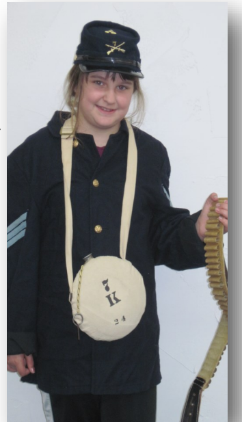
12, a reading competition and more!

having several special guests for our weekly Story Time program, and some special presentations too. We will also have a Superhero Science Club, a book club for ages 9-