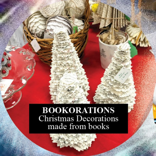
BOOKORATIONS Christmas Decorations made from books