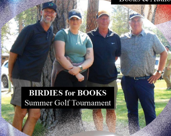
BIRDIES for BOOKS Summer Golf Tournament