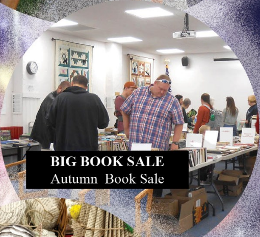
BIG BOOK SALE Autumn Book Sale