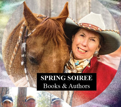
SPRING SOIREE Books & Authors