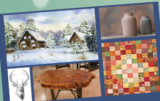
North Valley Public Library 3rd annual winter art exhibit