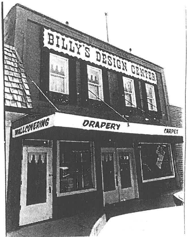
W. Elevation, Sleeve 5, Row 2, Neg 7

Builder: R.H. Rasmussen Original Owner: R.H. Rasmussen Original Use: Confectionery/Bakery Present Use: Home Design Center